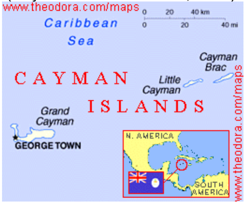
Figure 1: Map of the Cayman Islands, courtesy of www.theodora.com/maps, used with permission.

The Cayman Islands, a British Overseas Territory, consists of three flat limestone/dolostone islands located in the northwest Caribbean, 480 miles south of Miami, Florida (Figure 1). The total landmass of the three islands is 100 square miles. Grand Cayman is the largest, at 76 square miles, and the most populous, with 95% of the Islands' 40,000 residents (Cayman Islands Census, 1999).