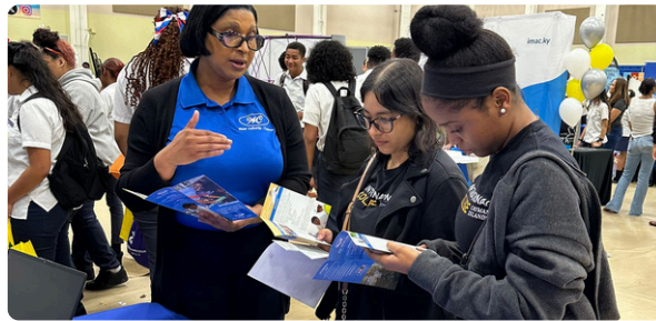
Images: 2026 John Grey High School Career Fair