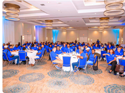
Image: 2026 ASM Meeting

On 27 March, the Water Authority hosted its Annual Staff Meeting, bringing employees together for a day of reflection, recognition, and team building. This year's theme, "Questing the Quest for Quality: Investing in Our People," highlighted the Authority's ongoing commitment to strengthening its workforce and empowering staff to deliver high-quality service to the Cayman Islands.