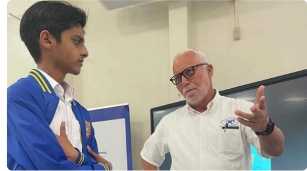
Images: 2026 Layman E. Scott Sr. High School Career Fair

Over four weeks in February and March, the Water Authority–Cayman connected with students across the islands through three major career fairs. The Authority's participation in the career fairs was a great opportunity to showcase the wide range of professions within the water and wastewater industry – from STEM-focused roles such as Engineer and Laboratory Technician to support services such as Customer Service and HR. The Authority participated in events at John Grey High School, Layman E. Scott Sr. High School, and the University College of the Cayman Islands.